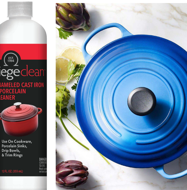
766L ENAMELED/CAST IRON & PORCELAIN CLEANER