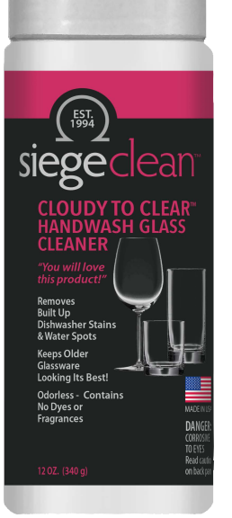
P-35 CLOUDY TO CLEAR™ HANDWASH GLASS CLEANER