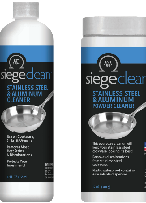
762L STAINLESS STEEL & ALUMINUM CLEANER