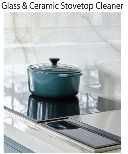
NEW LABEL DESIGN